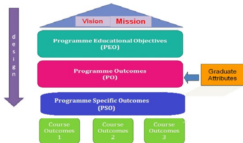
Fig1. Outcome Based Education Philosophy